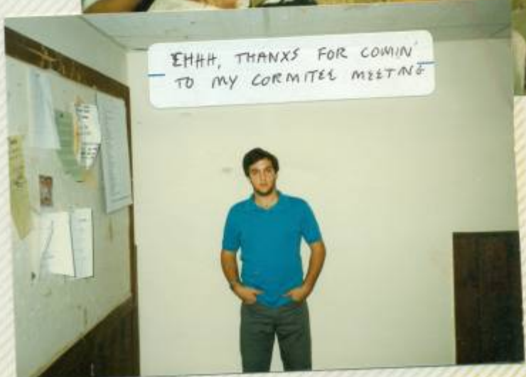
EHHH, THANKS FOR COMIN' TO MY CORMITEL MEETING