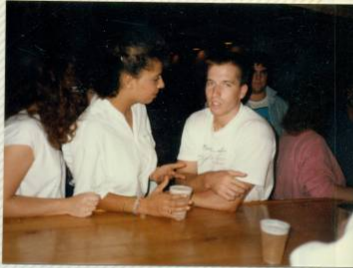
— WHITE GUYS w/ BLACK DATES —