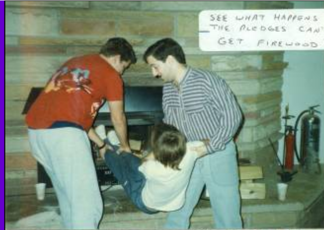
SEE WHAT HAPPENS WHEN THE BLEDGES CAN'T GET FIREWOOD?