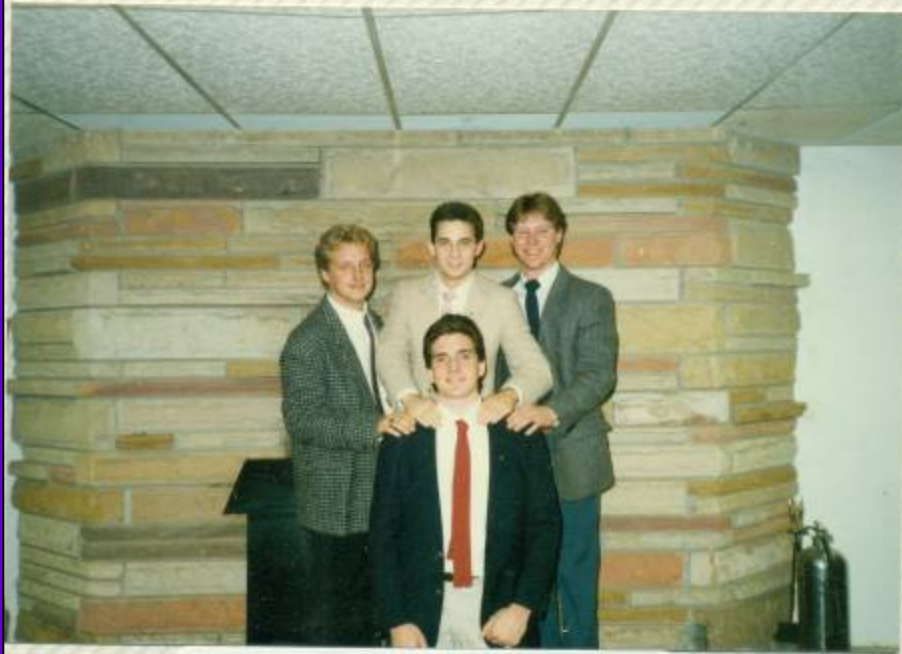
— PLEDGES FOREVER —