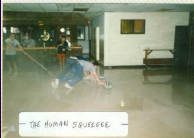
THE HUMAN SQUEEGEE