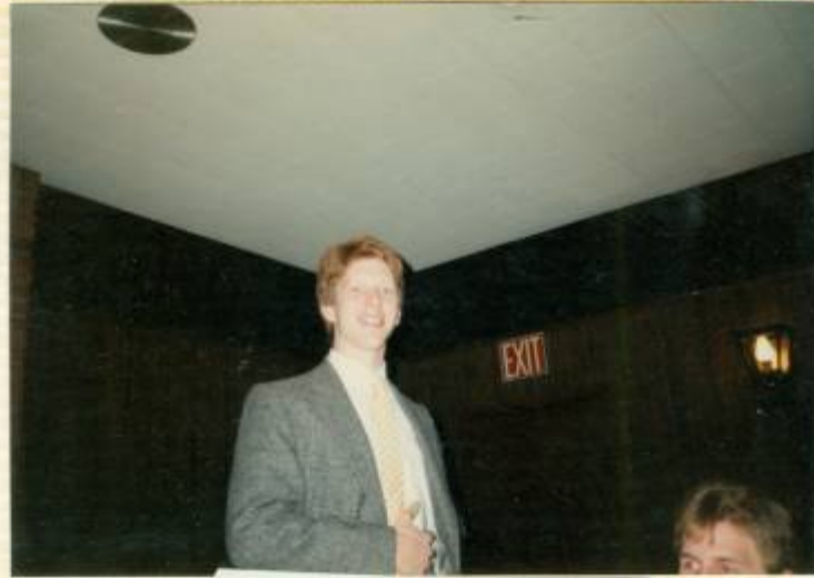
SENIOR OF THE YEAR