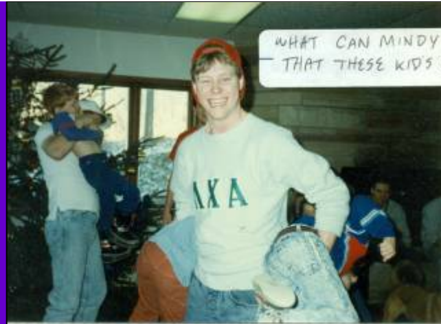
WHAT CAN MINDY DO THAT THESE KIDS CANT!