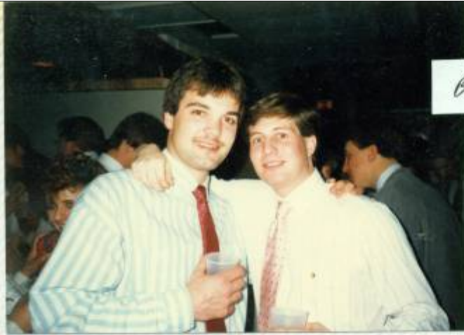
BROTHERS IN ARMS