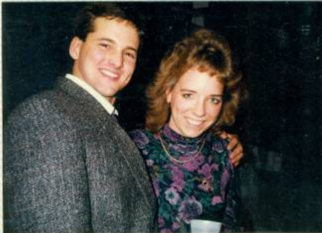
HE'S SO DREAMY...