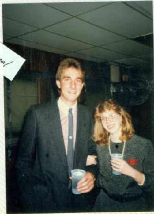
Spring '88 Formal