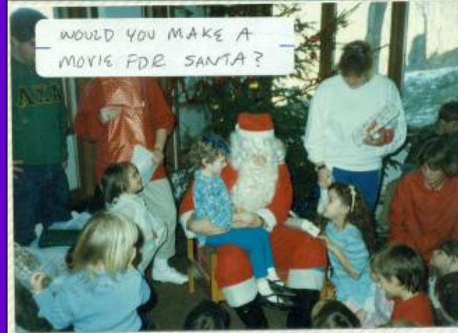
WOULD YOU MAKE A MOVIE FOR SANTA?