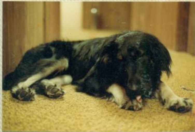
Bugart Licks An Unusual Place (Paw).