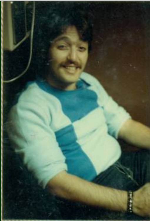
"Hi, How Am I?"