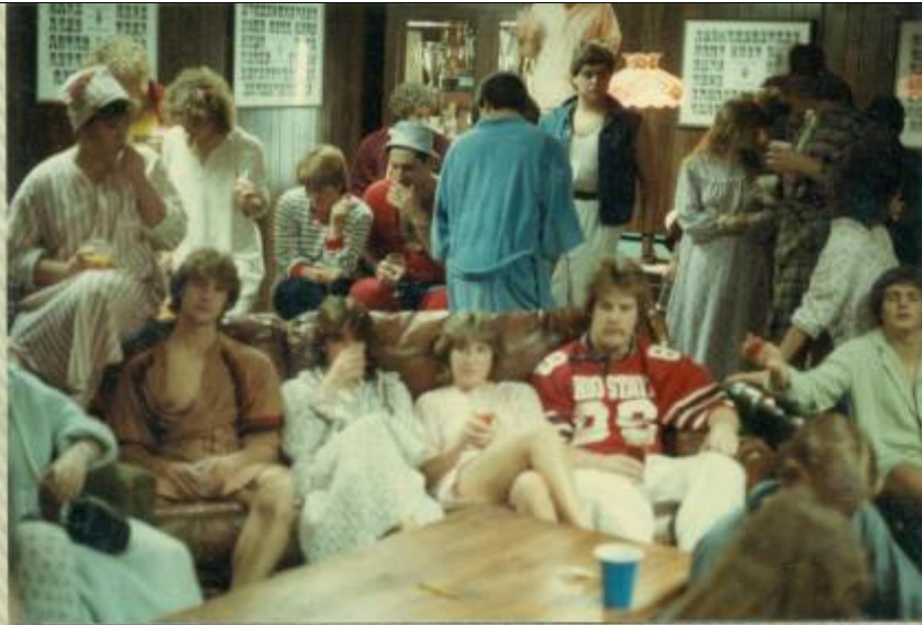
Waiting For Santa To Come.