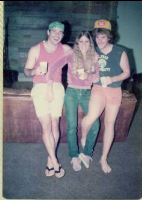
Now Isn't This The Kind of Action That Every Guy Looks For?