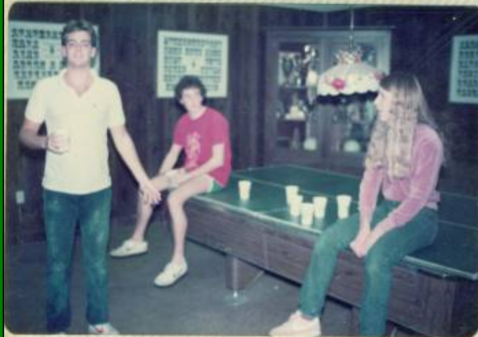
This Is Ed's Woman. Watch What Happens Next.