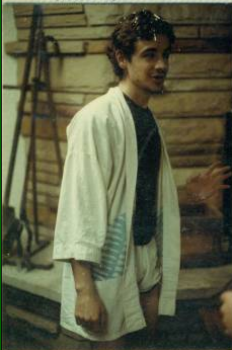
Twinkie, Twimela Little Rafe