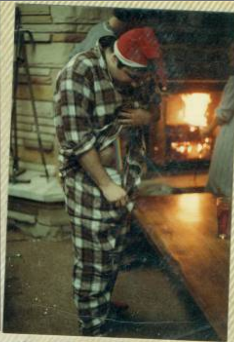
Some People Get Carried Away With The Christmas Spirit.