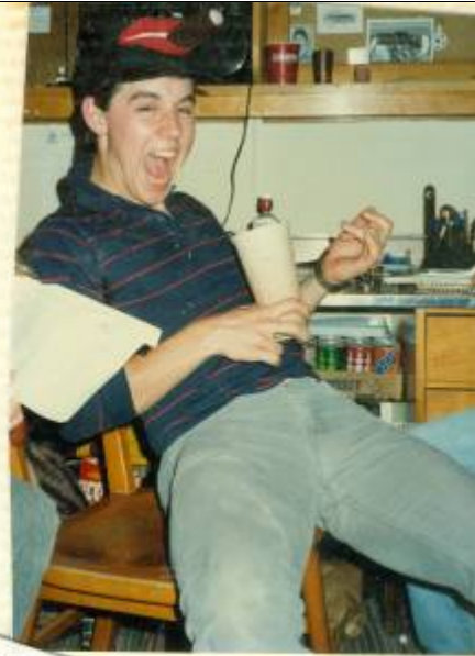
Beavis Night Out