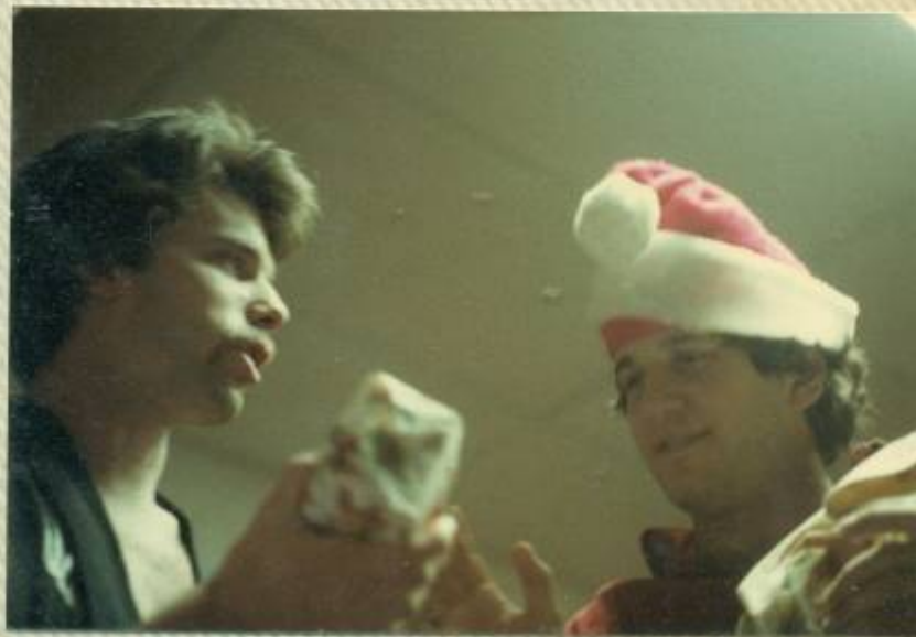
It's A Super-Electro-Hydraulic-Osterized-Thingamajig.