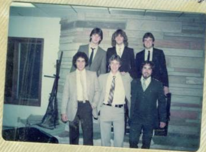
Wait A Second! I Thought There Were Only Three Sages!