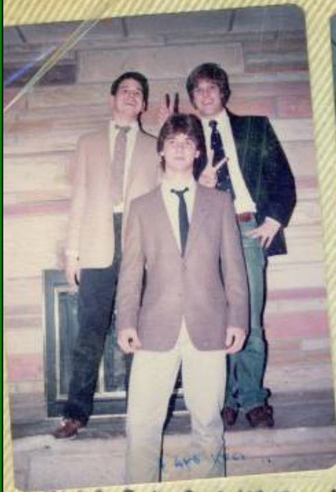
It's On Earth, Good Will Towards Man.